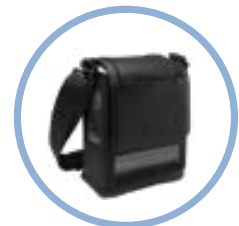
Inogen One G5 Carry Bag* Item #CA-500