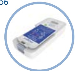
Inogen One G5 Lithium Ion Battery* Up to 6.5 hours run time Item #BA-500