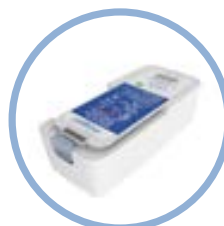
Inogen One ® G5 Extended Life Lithium Ion Battery** Up to 13 hours run time Item #BA-516