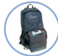
Inogen One G5 Backpack** Item #CA-550