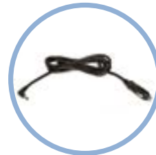
Inogen One G5 DC Power Cable* Item #BA-306