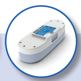
Inogen One® G3 Double Lithium Ion Battery** Up to 8 hours run time Item #BA-316