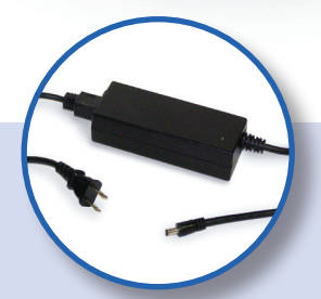
Inogen One® AC Power Supply* Item # BA-301