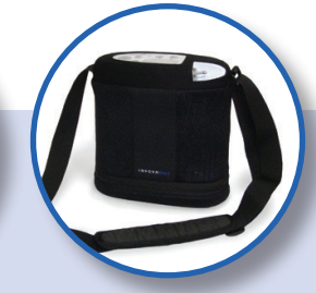
Inogen One® G3 Carry Bag* Item # CA-300