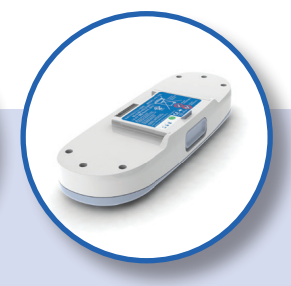
Inogen One® G3 Single Lithium Ion Battery* Up to 4 hours run time Item #BA-300