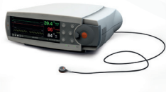
Transcutaneous CO 2 monitoring with Sentec