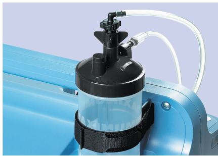
Humidifier bottle holder compatible with all bottle styles.