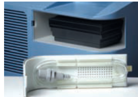
Internal tubing storage keeps tubing conveniently available for use.