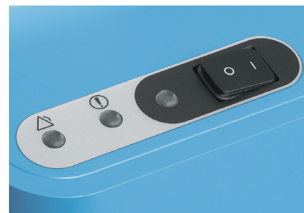
Interface panel with on/off switch and alarm indicators.