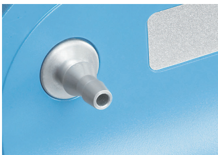
Metal cannula connector for greater durability.