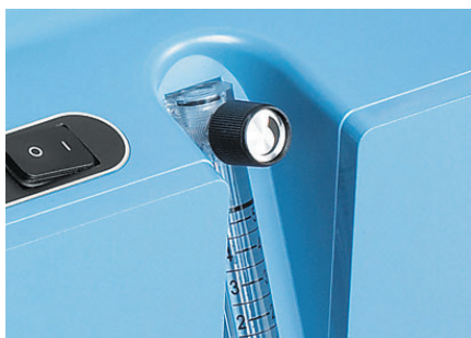
Recessed flow meter reduces the risk of breakage.